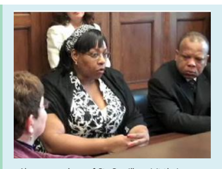
Above, members of St. Camillus visit their Senator to share their concern about war in the DRC. Below. they sell crafts.

Back at the parish, they stepped with the charitable works foot by holding a craft sale to benefit Catholic Relief Services programs that assist victims of war in the DRC.