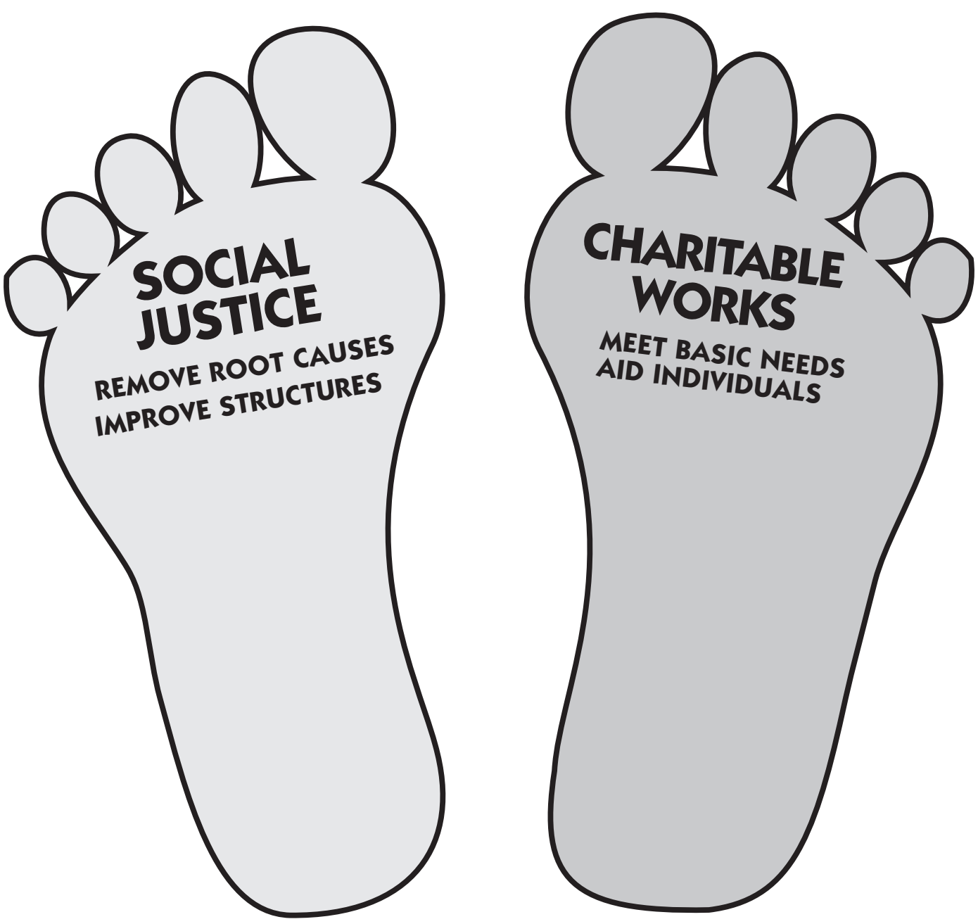
Copyright © 2011, United States Conference of Catholic Bishops. All rights reserved. This text may be reproduced in whole or in part without alteration for nonprofit educational use, provided such reprints are not sold and include this notice.